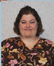
Pure (PJ) Gold Cardiopulmonary